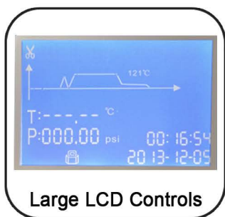
Large LCD Controls